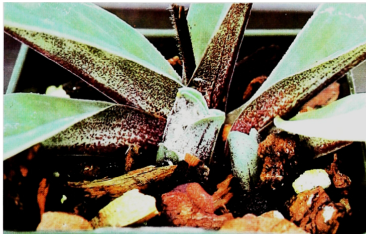
FIGURE 4 — Mealybugs infest this new Paphiopedilum growth.

Continued heavy infestation will result in a severely stunted and deformed growth.